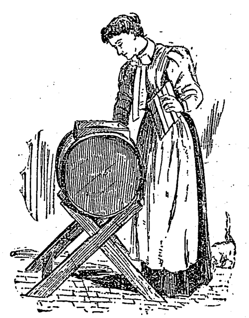
THE BUTTER REFUSED TO "COME."

Hope will never forget that evening. Outside was the soft sighing of the summer