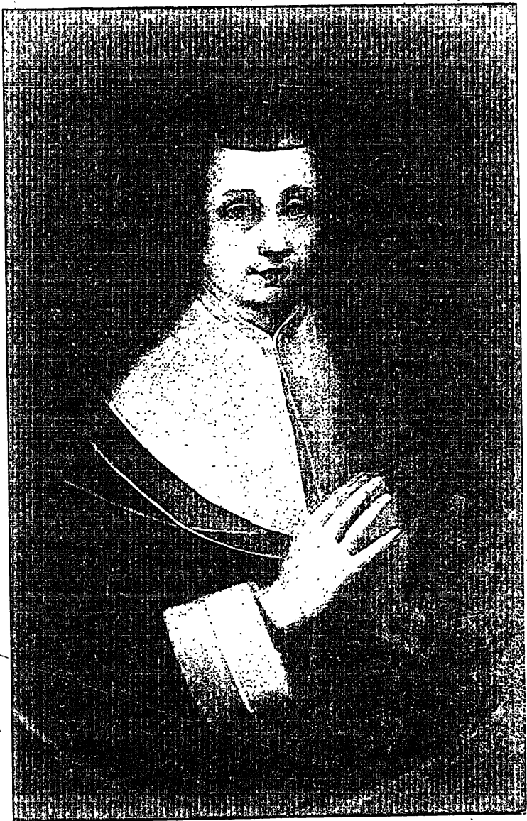
MME. DE LA PELTRIE (MARIE MADELEINE DE CHAUVIGNY).