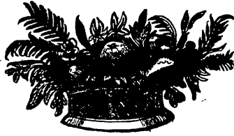
ILLUSTRATION TO VOL. XVI