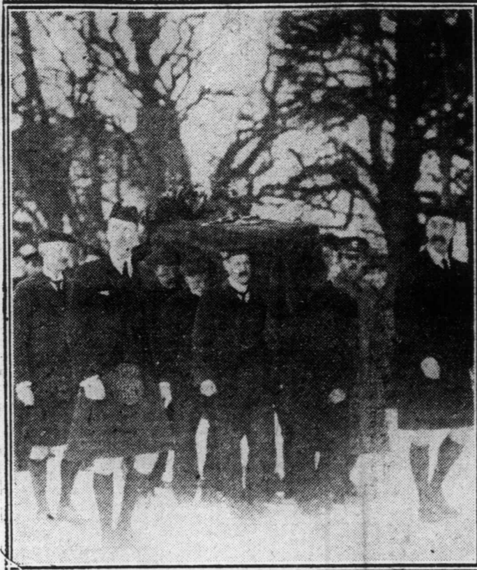
The photograph shows burial party carrying the casket of the late Duke of Atholl to the family plot in the grounds of Blair Castle. Distinguished officers of the Empire and officers of the Army and Navy made up the cortege.