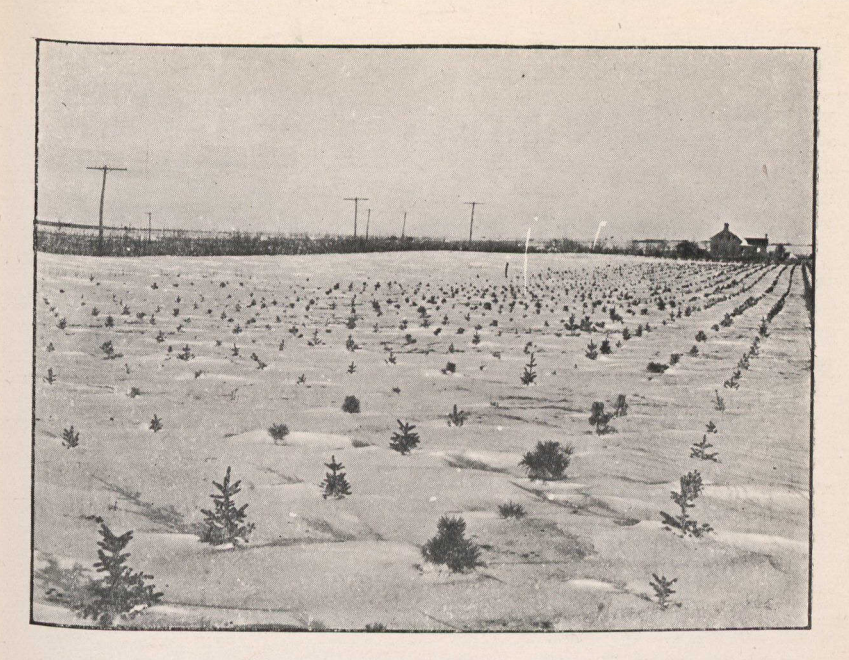
Young conifers at Indian Head.