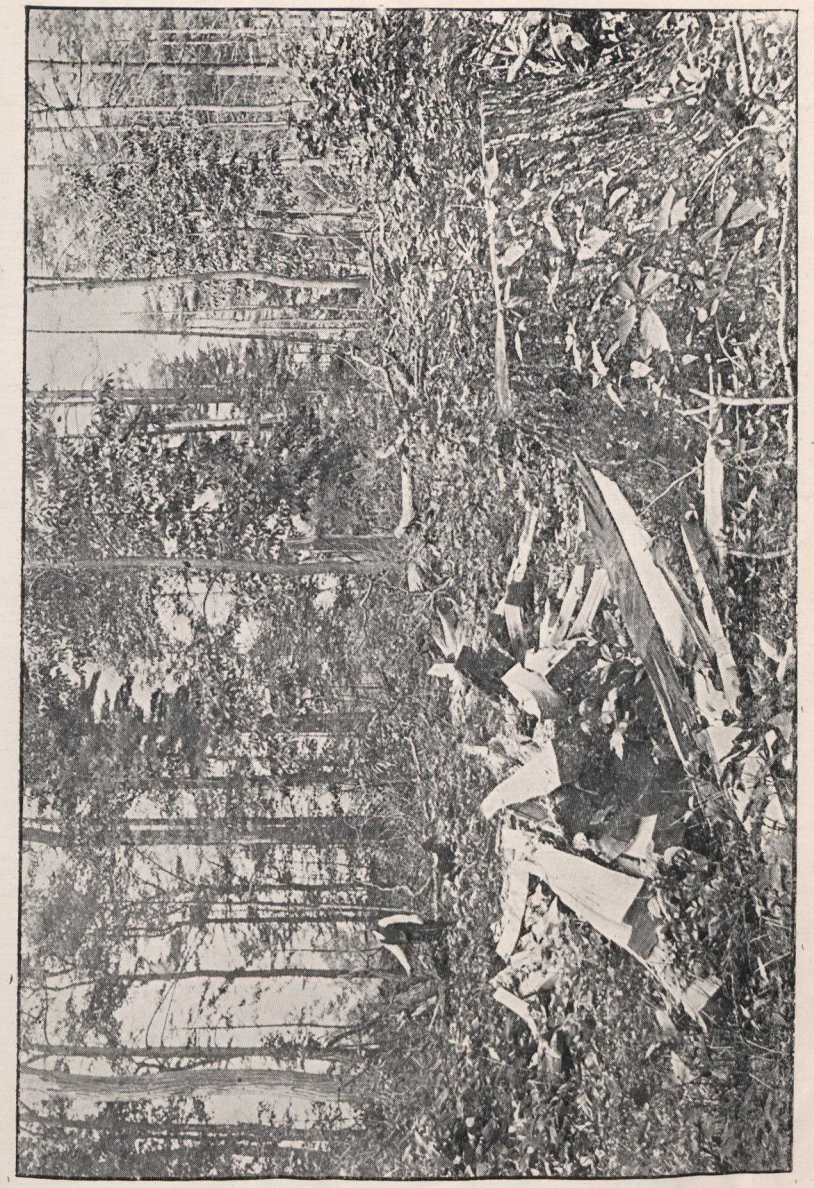
Chestnut fence posts. The tree from which these posts were made was over 3 feet in diameter and perfectly sound. It made 160 posts.