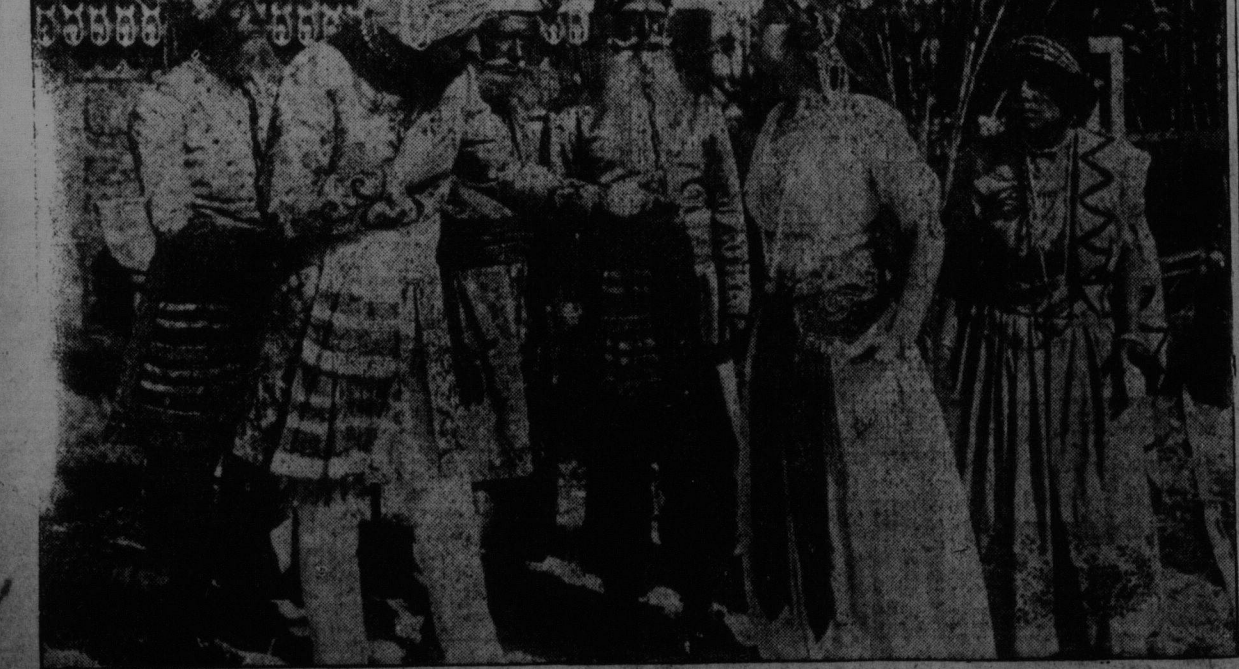
Kathlyn Again Refuses Umballa's Hand.

There are about two hundred copies of last Saturday's paper still on hand for any readers who failed to secure the story.