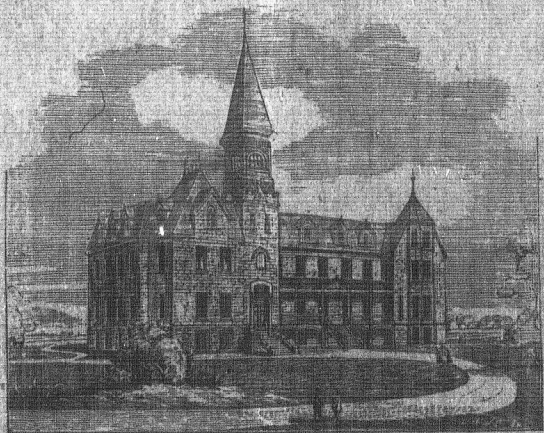
THE COUNTRY HOUSE ON THE MOLSON FARM.