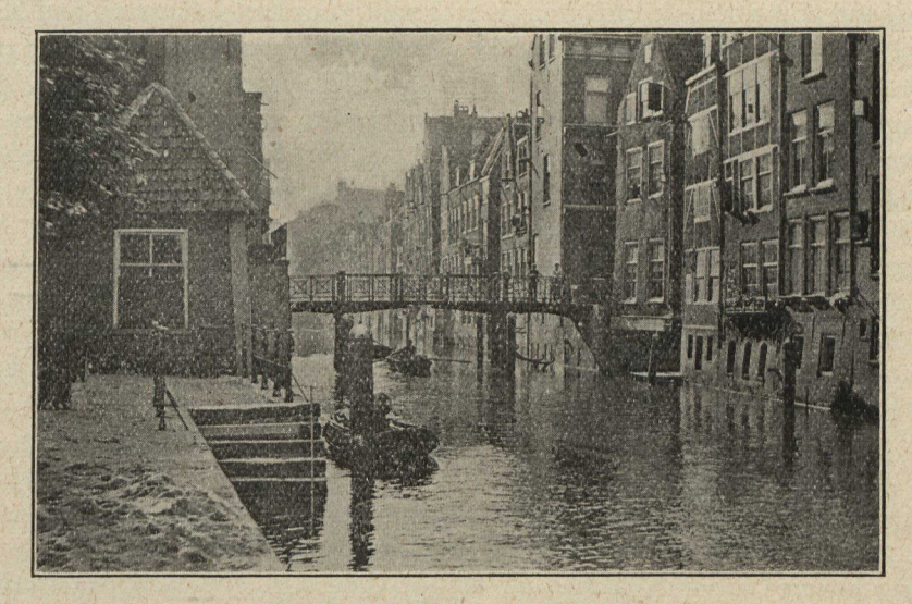
STREET SCENE, HOLLAND.