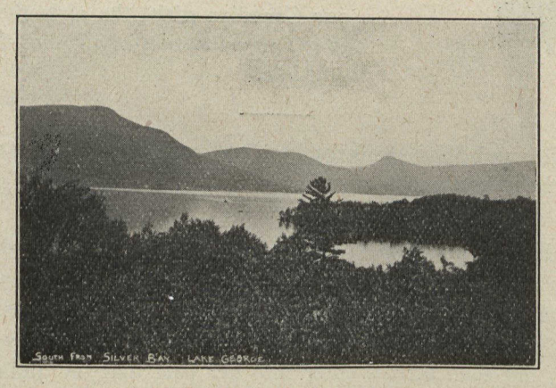
South Fish, Silver Bay, Lake George.

The general attitude towards co-education at the college is distinctly favorable and a warm interest is taken by all the girls in the doings of the football,