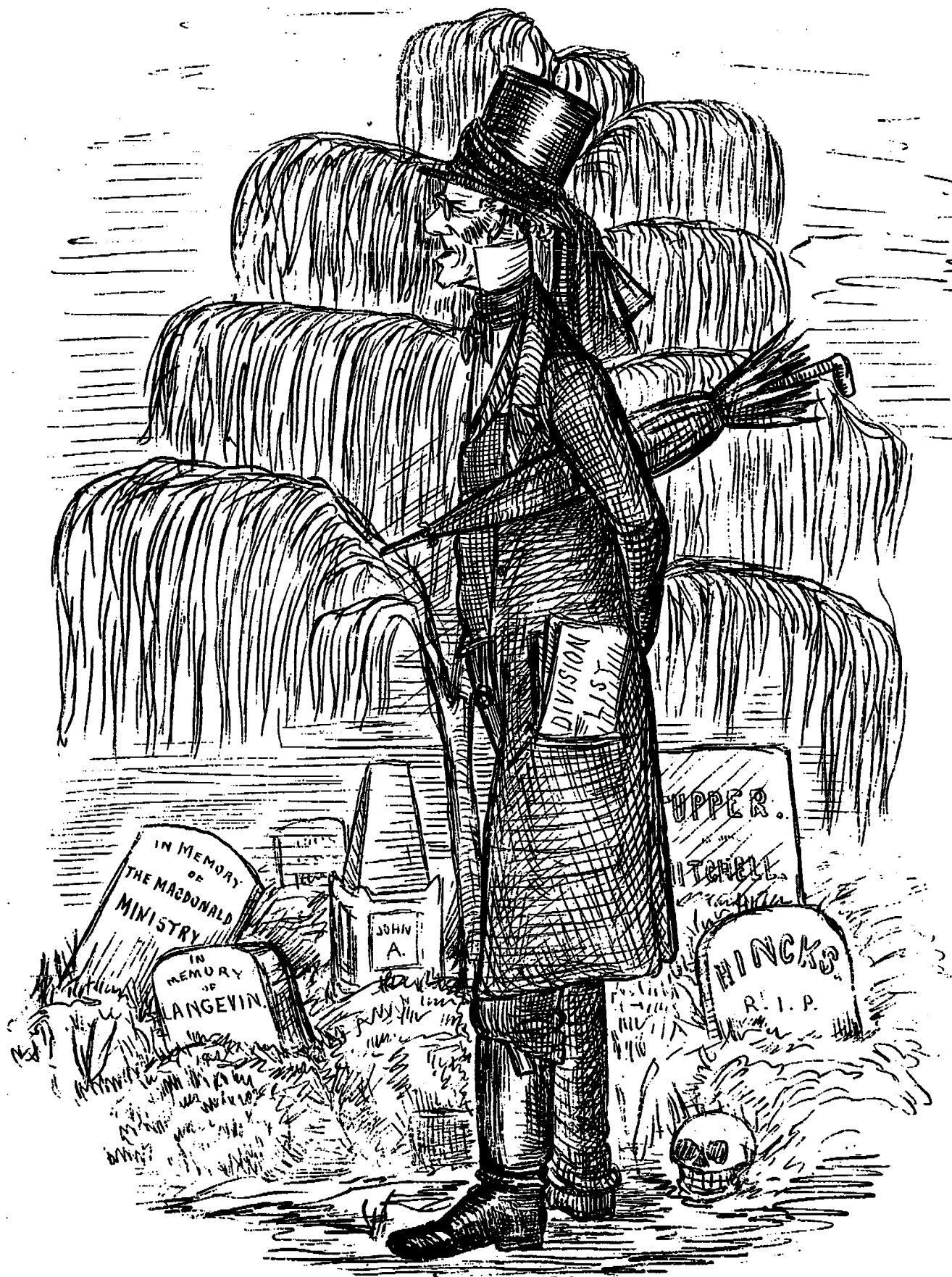
"OF COMFORT NO MAN SPEAK; LET'S TALK OF GRAVES AND WORMS AND EPITAPHS!"—SHAKESPEARE.