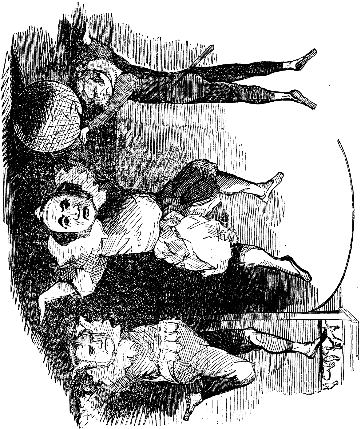
THE ACTUAL POSITION OF THE GOVERNMENT.