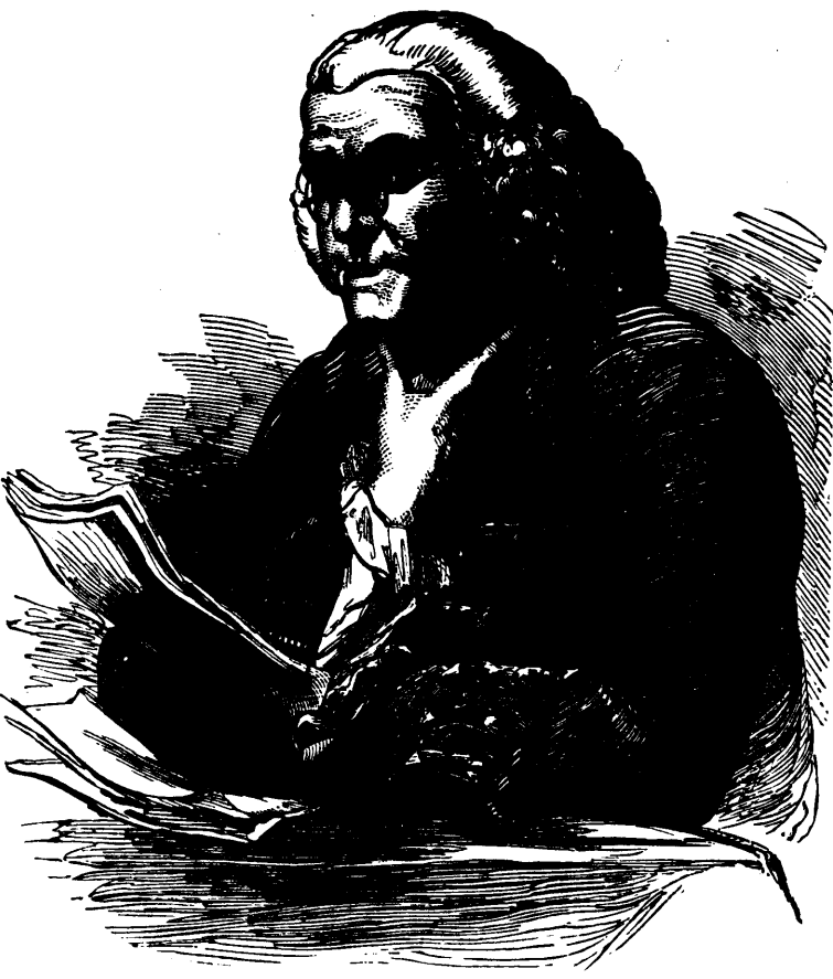
AN AMERICAN PHILOSOPHER-WHO CAN NAME HIM?

LEARNED men are not always wise men. Many of them are wise in some things but not in others. Some of the most learned men in the world have had very curious whims about different things, and