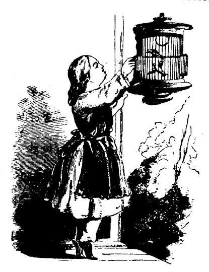
For the Sunday-School Advocate