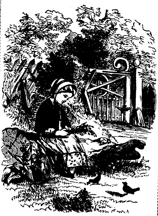
For the Sunday-School Advocate.

"I tell you, children, it is worth while to take good care of your teeth while you have them. Begin this very day, and do not stop as long as you live, and you will save yourself much sorrow for it."