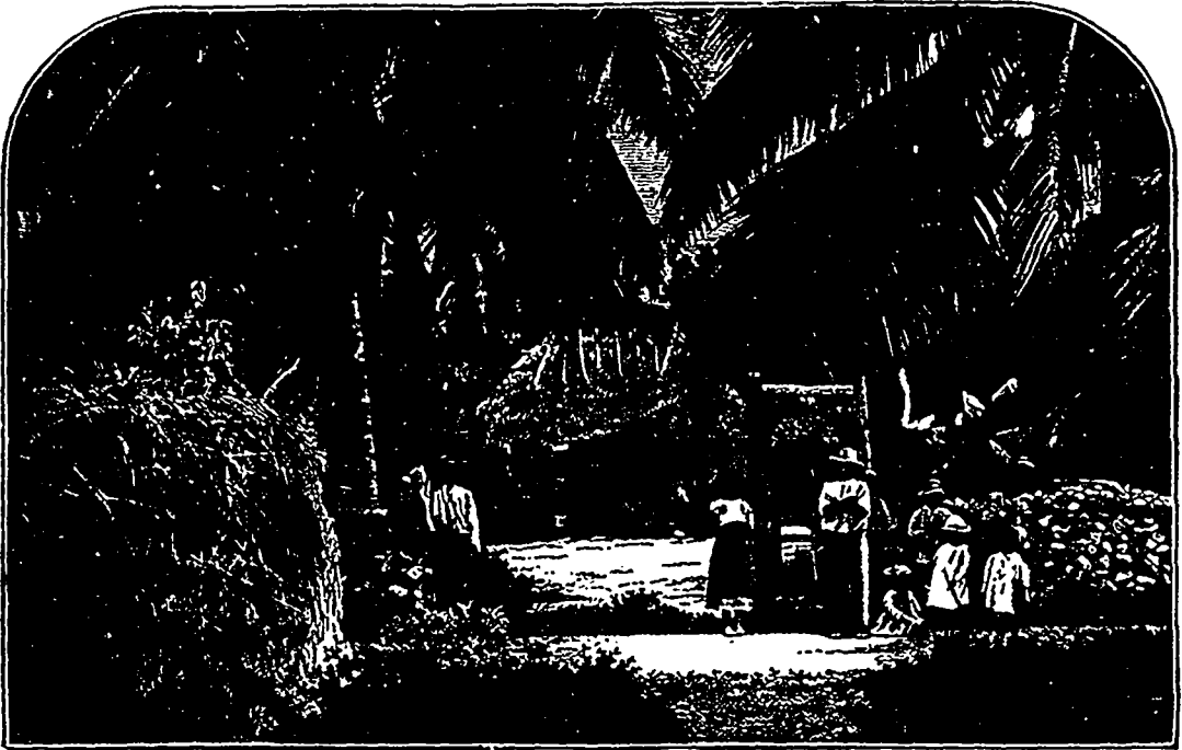
NATIVE CABIN IN GRANTSTOWN, NASSAU.