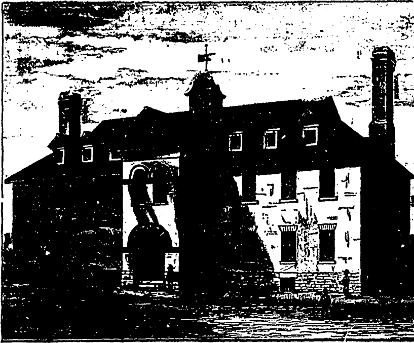
RUPERT'S LAND INDUSTRIAL SCHOOL.

than the political and social revolution which has taken place in this interesting country, a change which has not alone affected the men, but the women also, to a surprising extent.