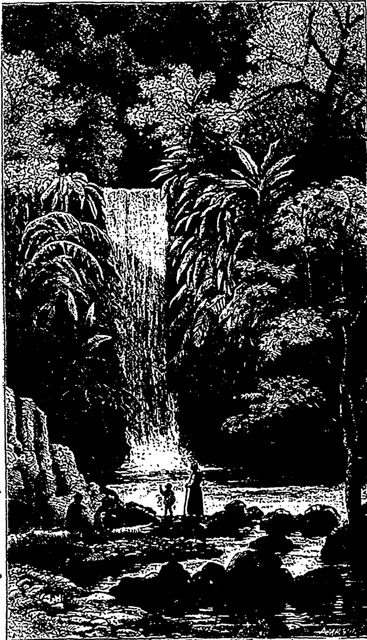
BLUE BASIN, TRINIDAD. (See page 30.)

in its preservation. Egypt, Assyria, Babylon, Persia, Greece, Rome, all the great nations of antiquity, arose, flourished, entered the charnel-house of departed empires and there moulded into almost utter forgetfulness, and China alone remains.— Missionary Review of the World.