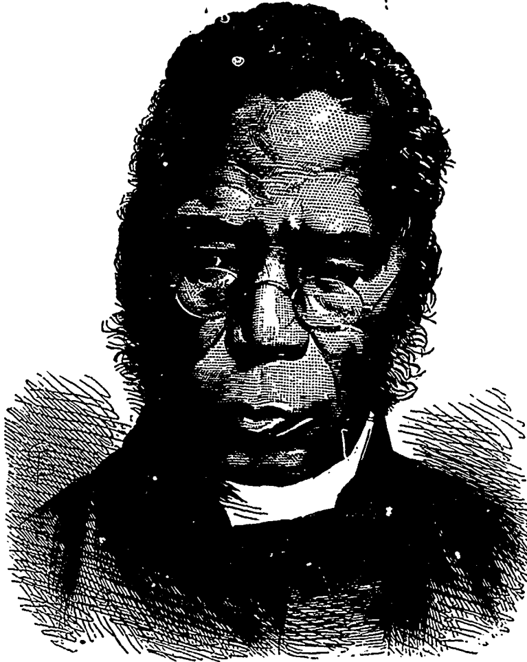
THE LATE BISHOP CROWTHER.