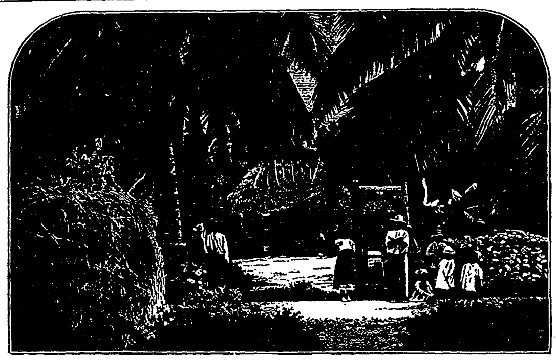
NATIVE CABIN IN GRANTSTOWN, NASSAU.