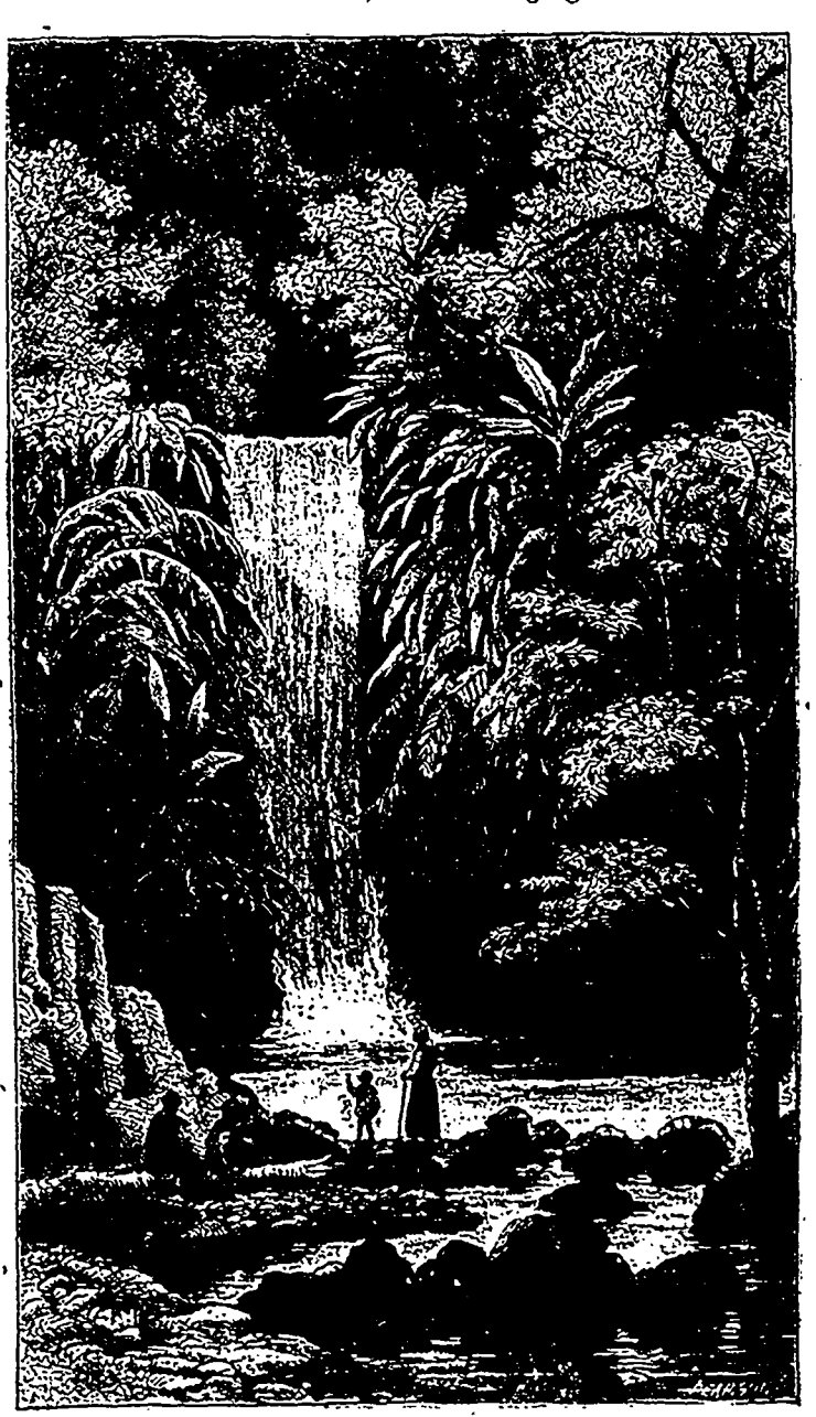
BLUE BASIN, TRINIDAD. (See page 30.)

China is unique in her antiquity. Her au-thentic history dates back more than 4,000 years -303 years subsequent to the deluge, 47 years before the death of Noah. If you were to undertake to write the history of China you would have to take the tenth chapter of Genesis for the first chapter of your history of the wonderful sons of Ham. It is a nation hoary with antiquity and marvellous