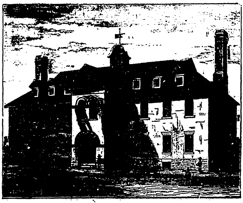
RUPERT'S LAND INDUSTRIAL SCHOOL.

than the political and social revolution which has taken place in this interesting country, a charge which has not alone affected the men, but the women also, to a surprising extent.