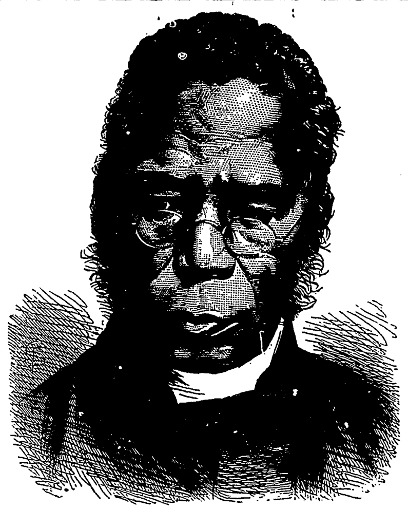
THE LATE BISHOP CROWTHER.