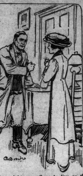
"You might as well go to live on the poor farm!"