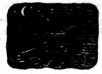
CHAPTER VI. - THE ESCAPE.

CHAPTER IV .- THE DEFEAT. TO THE OLD FOLKS.—Can you see the Board of Agriculture clothed and braced up by the "Canada Farmer?" Then old dog Faithful, the "Farmer's Advocate," watchfully come to the rescue of our agricultural prosperity? Then the farmer with a stick using it? Who will send us the best solution.