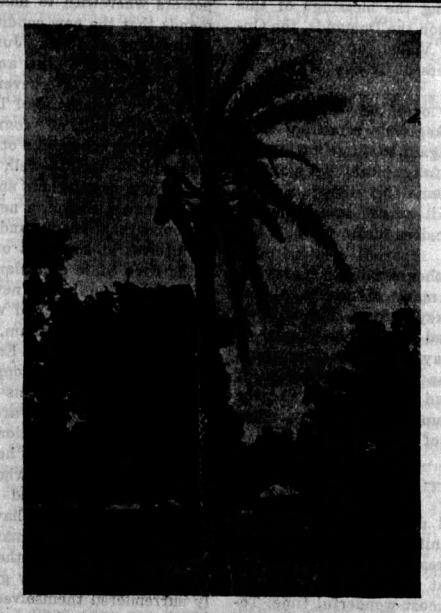
The Palmyra Palm

Published Monthly by The Women's Baptist Foreign Mission Board of Western Ontario