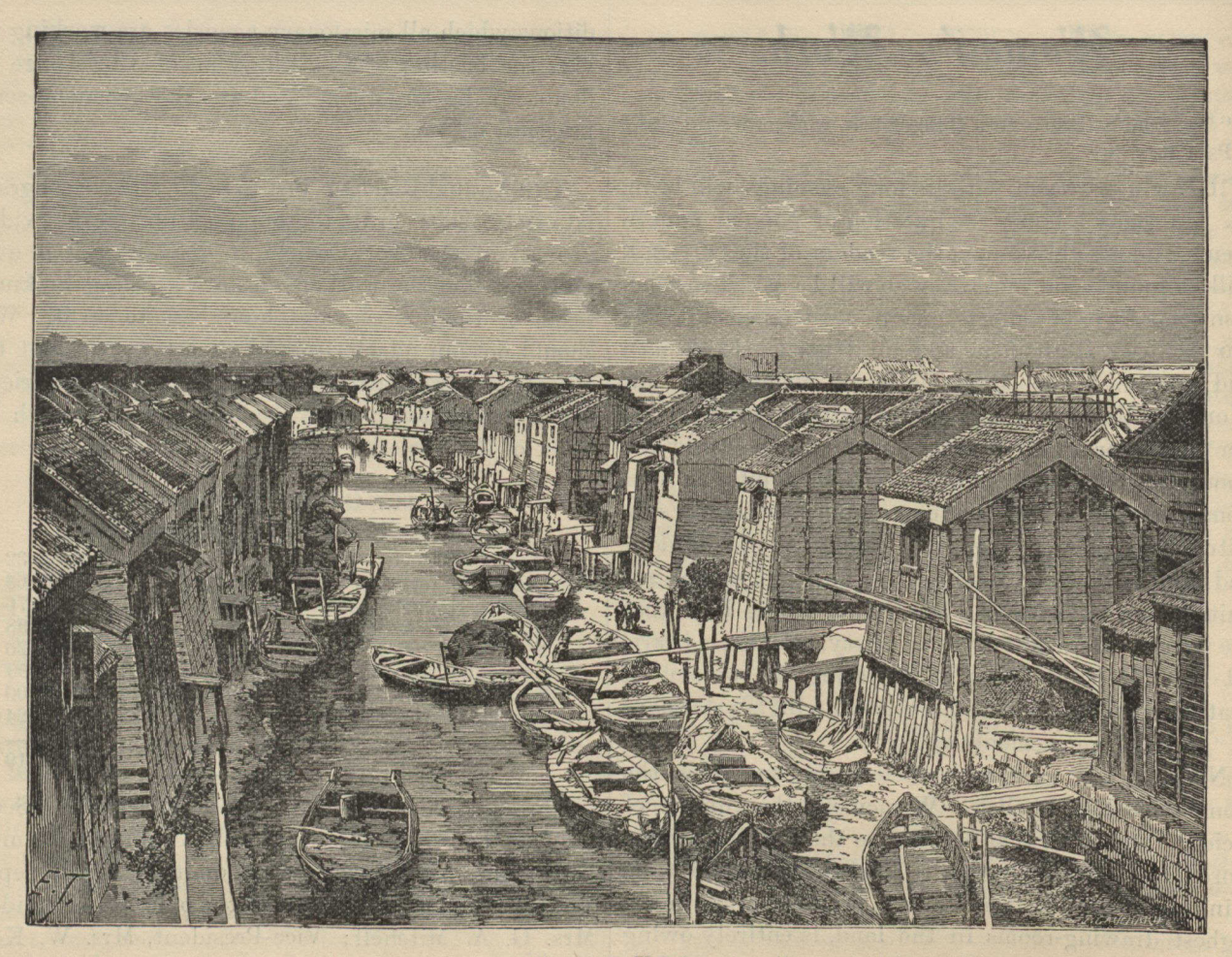
CANAL IN YEDO.