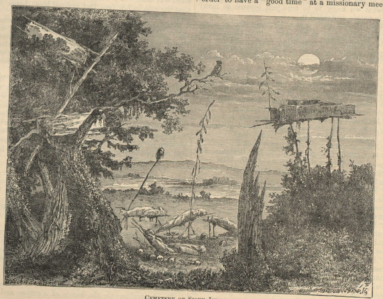
CEMETERY OF SIOUX INDINAS.

The chief aim of the society girl is to have a "good time," and if she is a Christian, and many society girls are Christians, she would have to be reconverted, in order to have a "good time" at a missionary meeting.