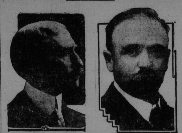
HENRY LANE WILSON, U. S. Ambassador to Mexico, who predicts that Diaz will remain in control. FRANCISCO I. MADERO, who aimed to succeed Diaz and leader of the revolutionary movement.