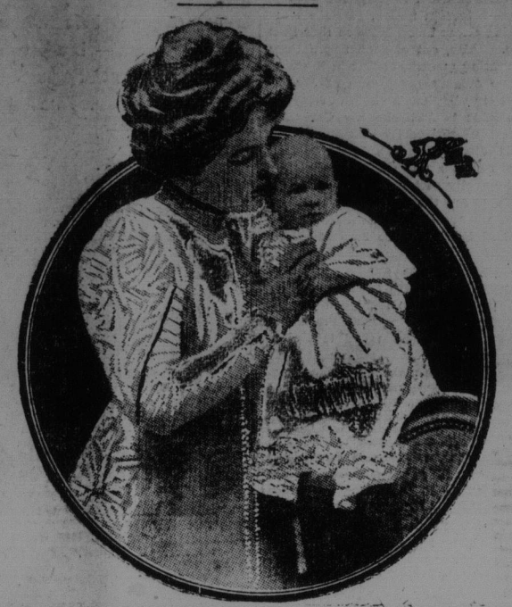
QUEEN VICTORIA AND HER ONLY DAUGHTER, PRINCESS BEATRICE