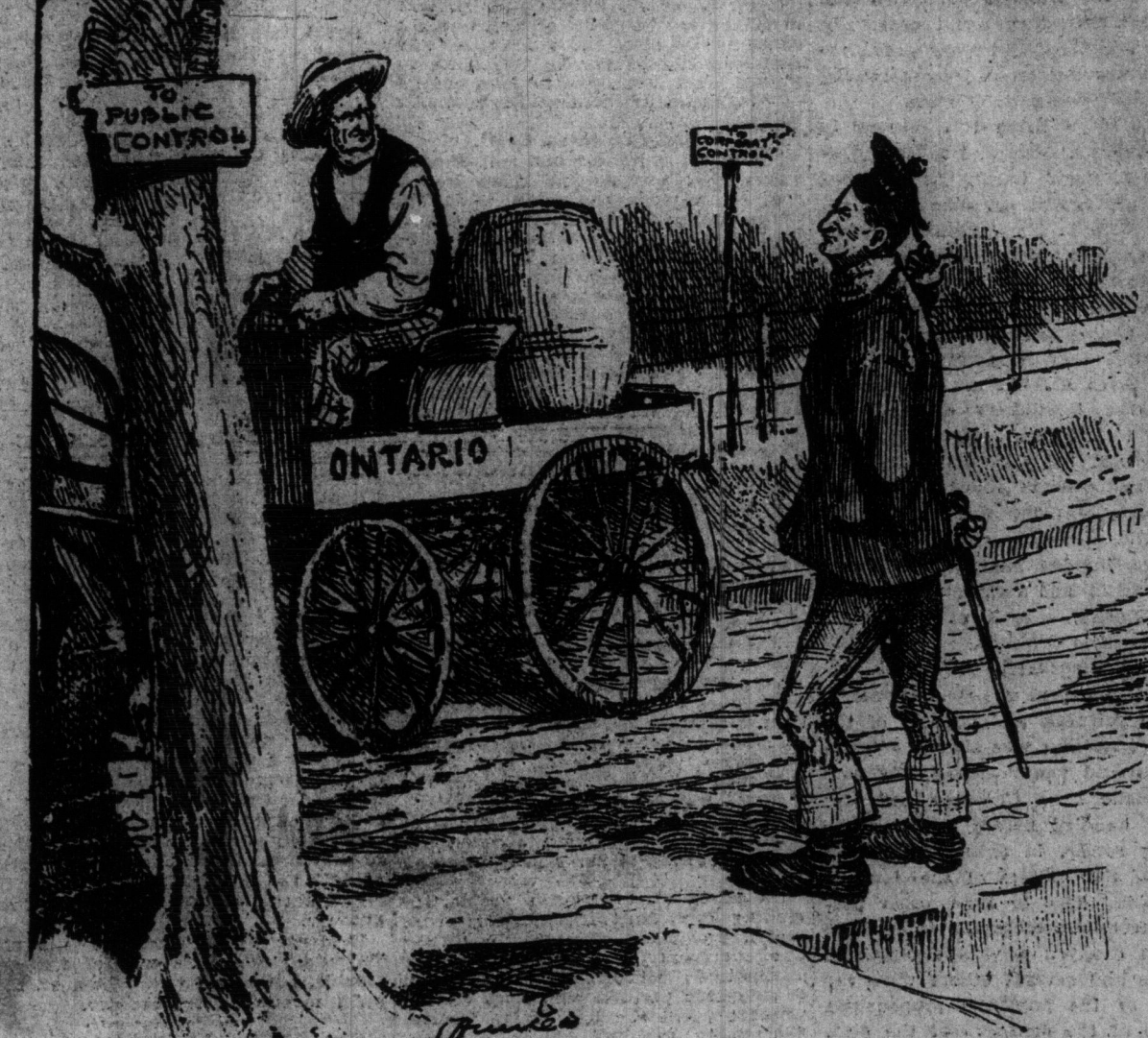
MR. MACKAY: Give us a lift, boss? OLD MAN ONTARIO: Sure, but not in that direction.