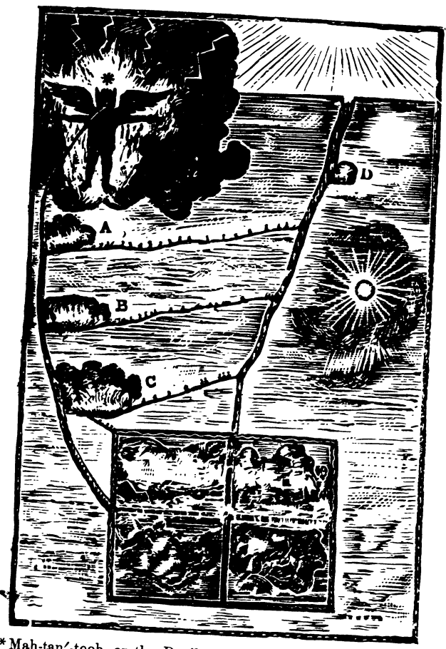
*Mah-tan'-tooh, or the Devil, standing in a flame of fire, with open arms to receive the wicked.