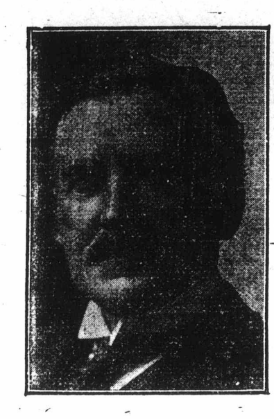
SIR THOMAS WHITE. Canada's Minister of Finance.

Particularly timely is the publication of a brochure entitled "Digest of the Income War Tax Act, Canada, 1917," which has just been issued with the compliments of the Royal Bank of Canada. An index adds materially to the value of the publication.