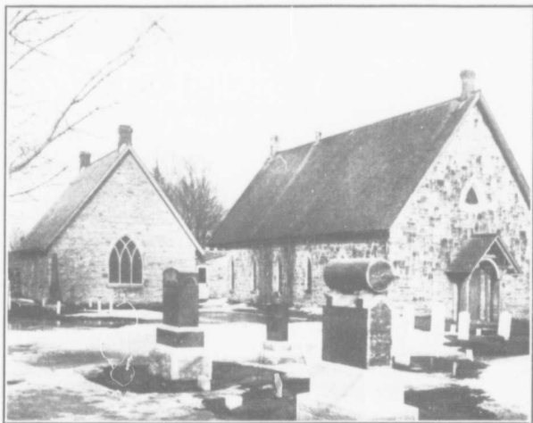
GRACE CHURCH and PARISH HALL (West End View)