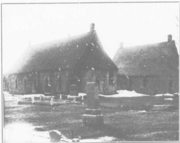
GRACE CHURCH and PARISH HALL (East End View)