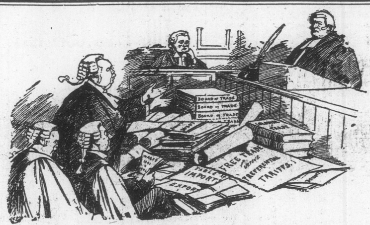
IN THE CASE OF FREE TRADE V. PREFERENTIAL TARIFFS.

"C.-B.," K.C.-"May it please Your Ludship, my clients ask only that you should give judgment at once-before you have heard the evidence!"