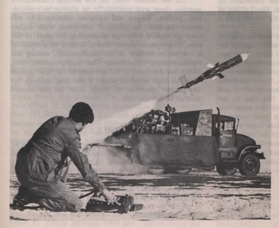
The launcher is raised to proper position, umbilicals drop away, and the aircraft is launched on its programmed flight.

system throughout the last three years has been under the management of the Project Management Branch of the Department of Supply and Services (formerly the Department of Defence Production).