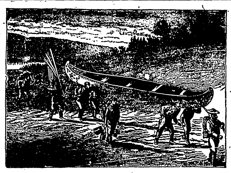
MAKING A PORTAGE

"And the forest life is in it, All its mystery and magic, All the brightness of the birch-tree, All the toughness of the cedar, All the larches' supple sinews; And it floated on the river Like a yellow leaf in autumn, Like a yellow water-lily."