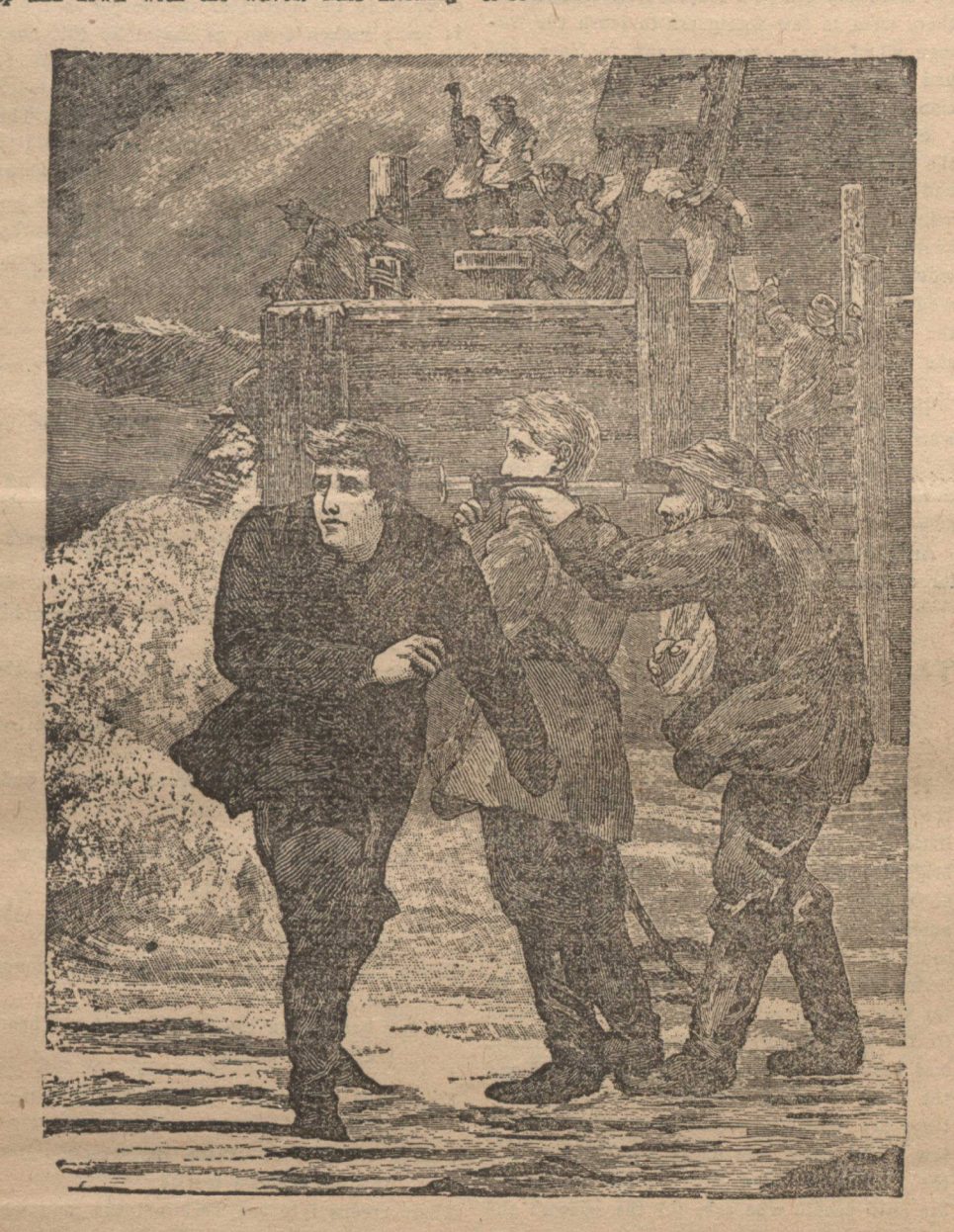
HE LOOKS EAGERLY THROUGH.

The infant wailed, and the watchman hurried away telling himself that if the gods had been