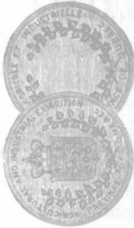
PROVINCIAL MEDAL, 1882.