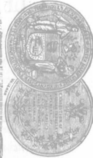
PRINCE OF WALES MEDAL, 1886.

PREPARED PATENT BARLEY, FOR INVALIDS AND DYSEPTICS. BARAVENA MILK FOOD, FOR INFANTS AND YOUNG CHILDREN. SUPERIOR FAMILY GROATS, FOR ALL PERSONS OF WEAK DIGESTION. PATENT PREPARED PEA FLOUR, FOR SOUPS, BROSE, GRAVIES, &c. DESICATED WHEAT, DESICATED BARLEY, ROLLED OATMEAL & DESICATED RYE. FOR SALE BY GROCERS AND DRUGGISTS.