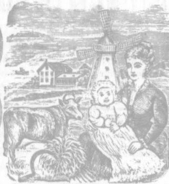
TRADE MARK REGISTERED.