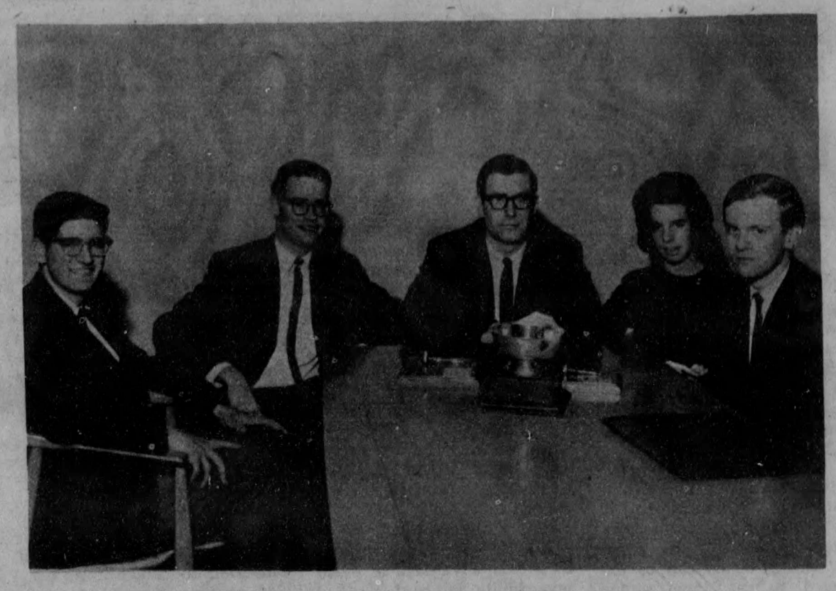
Among the many Carnival events is an international debating tournament, organized