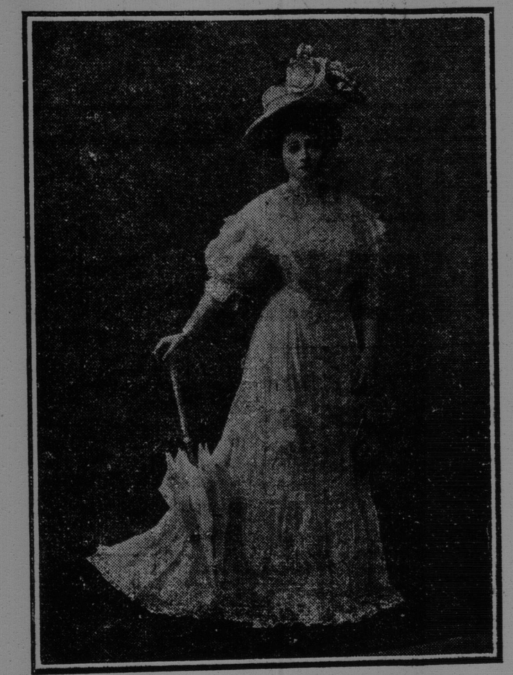
THE BEAUTY OF EMBROIDERIES.

So costly and intricate in design has the lingerie gown become that in its idealized development it easily ranks with the confections of rich, costly lace-silk and satin, which follow the modified Directoire models. Thus far the high-class lingerie costumes do not show the severely plain lines in the skirt, although they have the long effects, which are gained by the use of vertical trimmings and panels, many of which run unbrokenly from the shoulders to the feet. In these costumes lace insertions and medallions are extensively used, either mingling with muslin embroidery bandings or breaking into the beautiful allovers. In their turn embroidery medallions and galloons are appliqued upon filet net, which is used in the form of bandings, yokes and edgings.