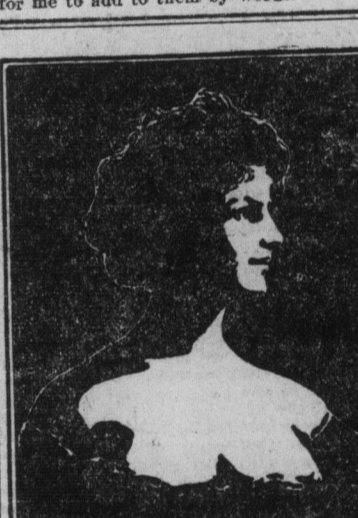
Corsine FORM AND BUST DEVELOPER. WE WILL SEND FREE.

YE OLD FIRM OF HEINTZMAN & CO. ORGAN BARGAINS. AND YOUR OWN TIME TO PAY.