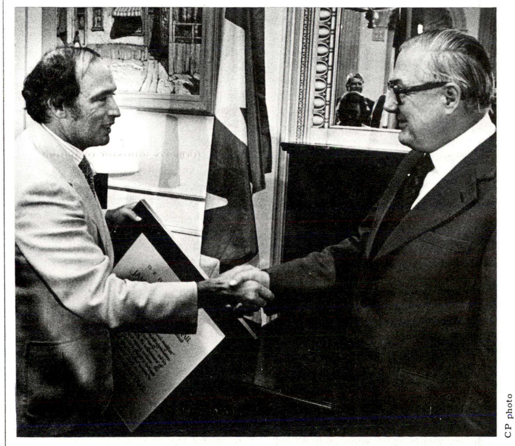
Prime Minister Trudeau holds the dedication naming the James Callaghan | Prime Minister Callaghan in Ottawa.

"In recognition of James Callaghan's steadfast dedication to the preservation and appreciation of the natural beauty of our world - and his untiring efforts toward the achievement of peace and brotherhood among nations, the Government of Canada is pleased to dedicate the hiking trail ascending the highest mountain of Gros Morne Park as the James Callaghan Trail."