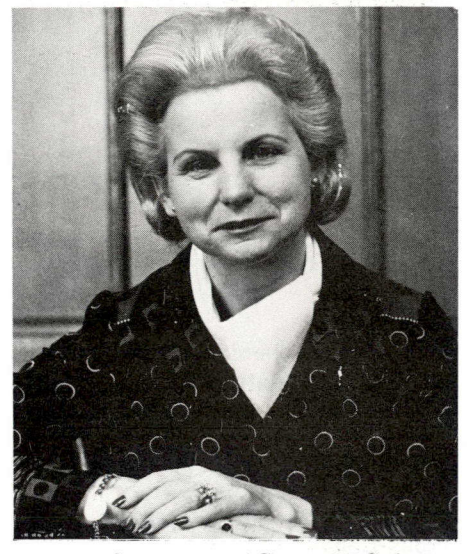
became Secretary of State for Science and Technology in 1972 and Minister of the Environment in 1974. She was appointed Minister of Communications in December 1975.