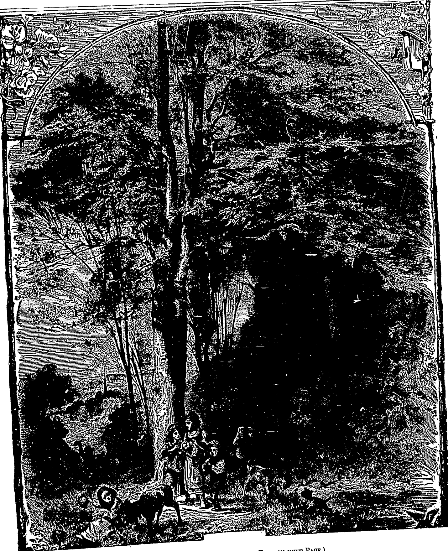
THE WOODS IN SUMMER .- (SEE TEXT ON NEXT PAGE.)