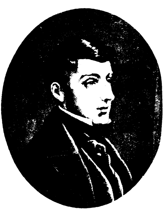
Rt. Hon. Charles Poulett Thomson, Lord Sydenham.)