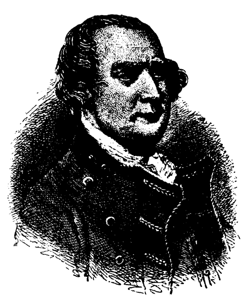
LORD DORCHESTER, GOV.-GENERAL.