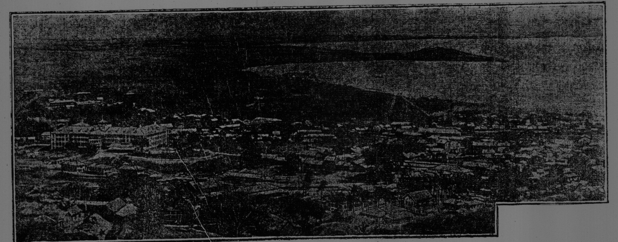
A BIRD'S EYE VIEW.

SAYS LAVERGNE Governor Swettenham Appeals for Aid in Rebuilding the City --- Subscription List Re-opened.