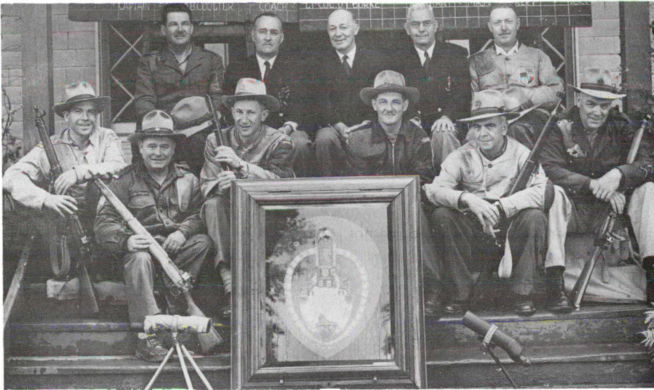
The Canadian Rifle Team – Bisley 1953 Winners of the Empire Match