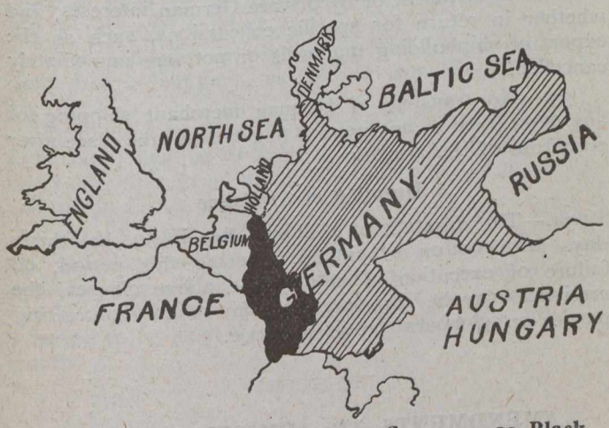
Allies Will Occupy Big Slice of Germany, as Black Area Shows

16.—The allies shall have free access to the territories evacuated by the Germans on their eastern frontier either