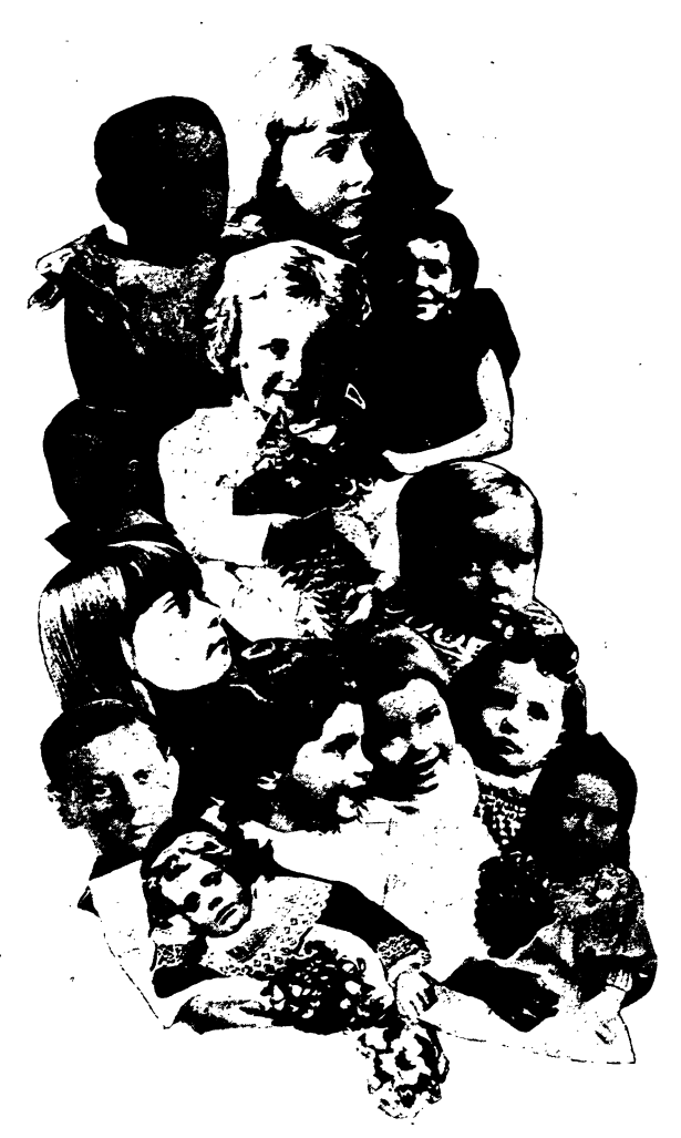
A BUNCH OF PRAIRIE FLOWERS.