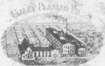
A. W. ALLEN & SON, MIDDLETON, N. S.

ILLSLEY & HARVEY Co., Ltd Port Williams, N. S.