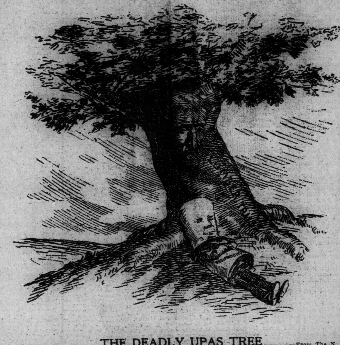
THE DEADLY UPAS TREE

Numerous Political Conventions Indicate that General Election is Drawing Near.