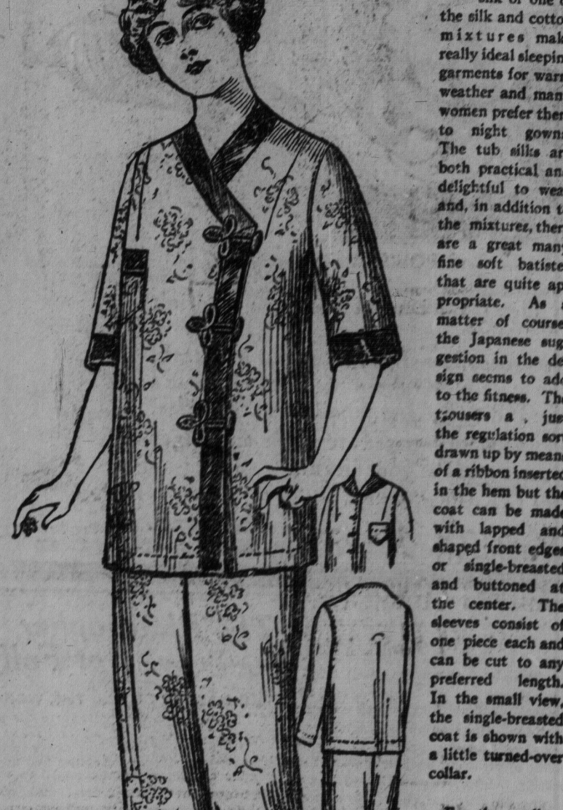
Design by May Manton. 7920 Women's Pajamas, 34 to 40 bust.

PAJAMAS that are made of silk or one of the silk and cotton mixtures make really ideal sleeping garments for warm weather and many women prefer them to night gowns.