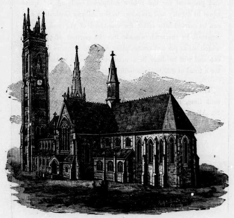
CATHEDRAL OF ST. ALBAN'S.