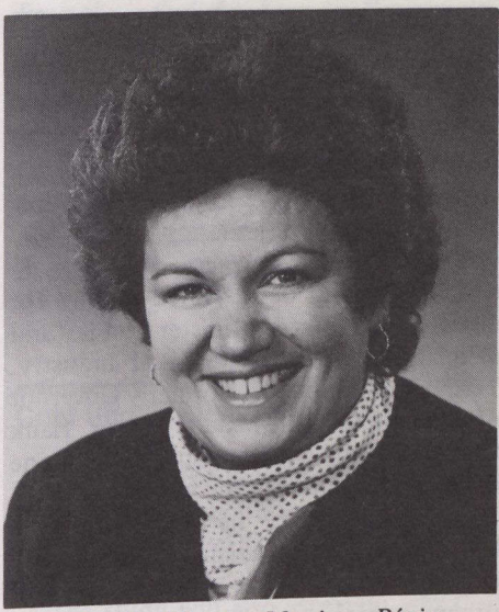
Health Minister Monique Bégin

The minister said that the World Health Organization's "Health for all by