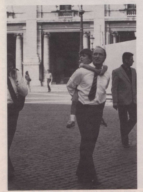
Prime Minister Trudeau and youngest son Michel tour Rome.

Algeria is Canada's largest customer in Africa with 1980 exports to that country reaching a high of $400 million. Exports to Algeria consist primarily of agricultural products, lumber, prefabricated buildings and asbestos. Current projects under negotiation between Canadian