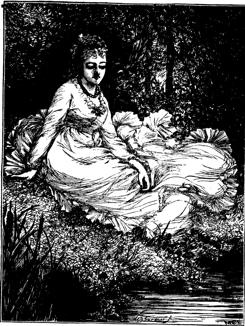
"FOND EYES LOOKED ON ITS DEWY SHEEN."

Fairest of earth's dear daughters, Bright eyes looked on its dewy sheen, And the songs of their lives rang clearly:— "The world is fair! the world is fair!" "And I love, I love you dearly."