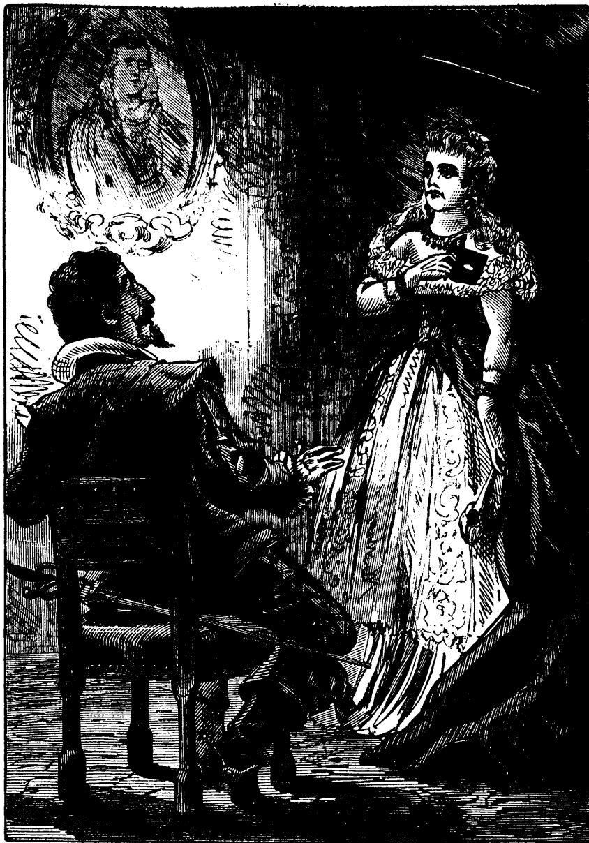
"SHE REMOVED HER MASK, AND LOOKED FIXEDLY AT HER INTERLOCUTOR."

As soon as he was in the street, De Maurevert, according to his praiseworthy habit, set himself to examine from all points of view the new business on which he was entering; for, in offering to act as messenger to Raoul, he had an ulterior object in his mind. "I must not shut my eyes to the fact I have a very delicate mission to fulfil, and one that is beset with difficulties," he said to himself as he walked at a slow pace. "How shall I contrive to gain admission to the little house on the Marché-aux-Chevaux? In what manner shall I address its mistress when I reach her? Bah!—is not chance my friend? It is sure to help me out of all difficulties." Without any fixed plan of action, therefore, the captain at length reached his destination. "The deuce!" he said to himself, after having carefully examined the mysterious habitation—"windows shut, blinds close-drawn! Does nobody live here? No; I see how it is. I have chosen ill the hour of my visit. The goddesses who preside over these discreet retreats resemble planets, that only take their flight by night;