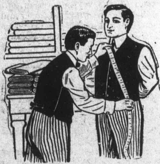
THE STRAIGHT AND BIAS

facts between ready-made Clothing and the FINE CUSTOM TAILORING turned out of our work-rooms are radically different. By our made-to-measure system every suit gains in distinction and individuality. The big thing about our tailoring is the character of the fabrics we offer, their style and finish. The public may make certain that nothing in this town equals it. We maintain the same high standard and low prices in spite of the present pow-wow about "great rise in goods."