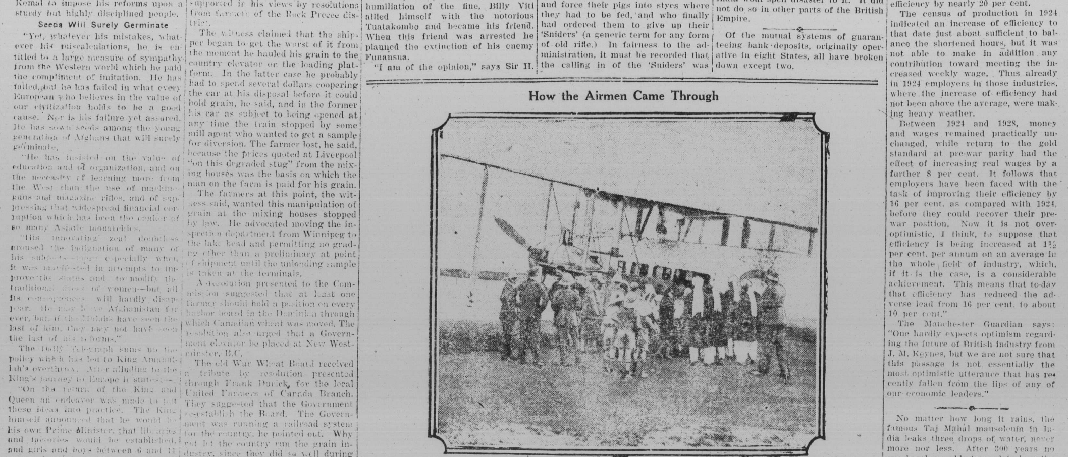
HOW THE WOMEN WERE RESCUED FROM KABUL First party of