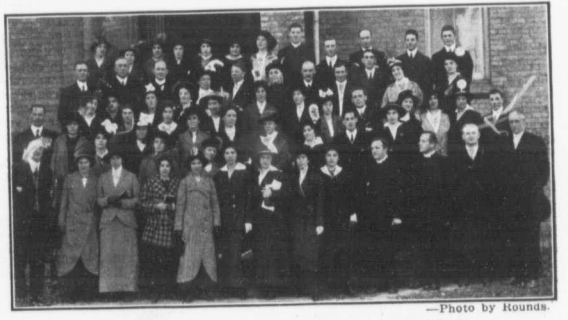
DELEGATES AT WOODSTOCK DISTRICT CONVENTION.

vate the new-comers to our standards. We must not let them contaminate us.