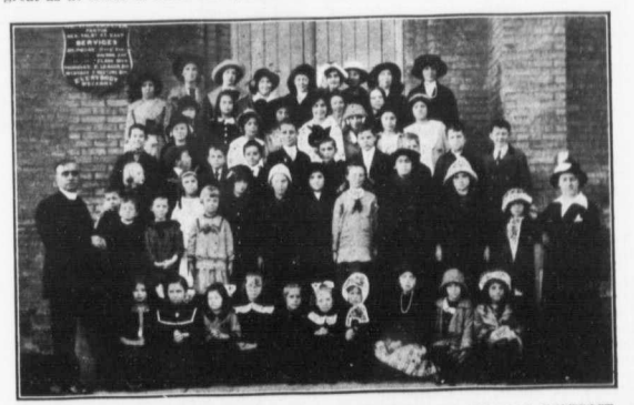
JUNIORS WHO CONTRIBUTED TO THE SUCCESS OF ST. THOMAS DISTRICT CONVENTION AT AYLMER.

"I hereby send thee my pocket clock, I hereby send thee my pocket clock, which standeth in need of thy friendly correction. The last time it was at thy school it was in no way benefited or profited thereby, for I perceive by the index of its mind that it is a liar, and the truth is at this. the truth is not in it. Purge it, therefore, I beseech thee, and correct it from the error of its ways and show it the paths wherein it should go, and when wherein it should go, and when thou layest thy correcting hand upon it see that it be without passion, lest thou shouldest drive it to destruction, and when thou seest it conformable to the above-mentioned rules send it home to me with a just and true pill drawn out in the merit of moderation, and I will remit it to thee in the root of all evil."