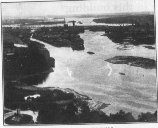
VIEW OF THE CHAUDIERE FALLS. From Top of Tower of Parliament Buildings, Ottawa.

for our organizations. We find that prayer economizes time. We find that prayer economizes line . Our work will plan better, if under the guidance of God. Your topic for League will make greater progress under the in-fluence of prayer, and the study of the Sababit-School lesson will develop better methods and more spiritual when mingled in community with God. in communion with God.