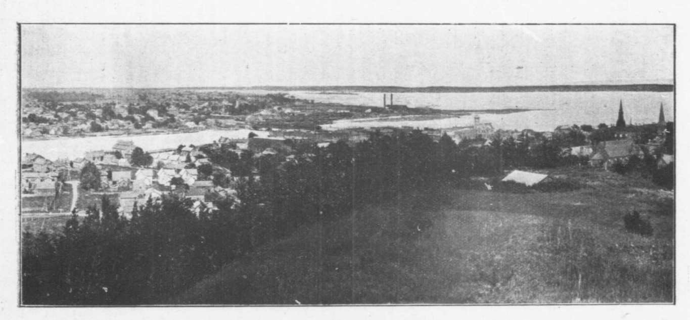
View of Trenton From The Mountain.