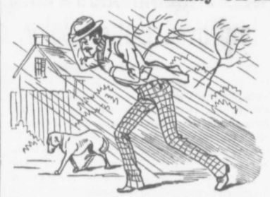
In the gentle springtime he putteth on his summer clothes, and a blizzard striketh him far away from home, filleth him with woe and rheumatism.