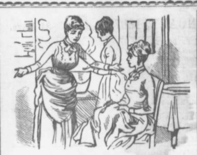
"Allie," she cried, ' I have an idea."

it before. We will color those white dresses; then made over, they will be past recognition. Where are your dyes, mother? Pink for you, Allie; and I will have—let me see—blue? No, lavender. I have always wanted a lavender dress. We'll stand together and call ourselves a symphony in pink and lavender. It is the loveliest combination in the world."