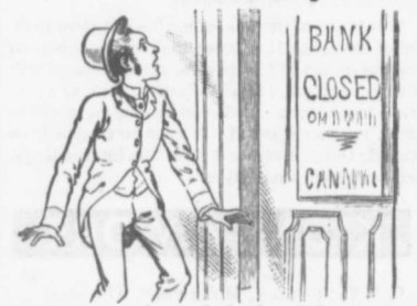
He layeth up riches in the bank, and the president speculateth in margins, and then goeth to Canada for his health.