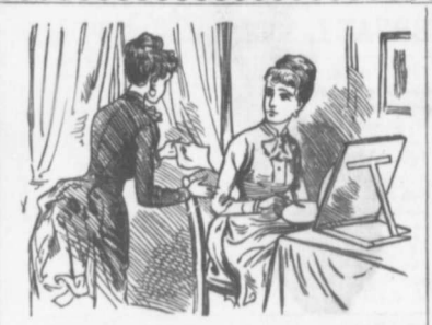
But as Theo entered her sister's room one afternoon with an open letter in her hand, a very woe-begone face was presented to her.

flower. You must not be discouraged at the first failure; keep trying."