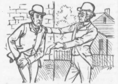
He walketh forth in the bright sunlight to absorb ozone, and meeteth the bank teller with a slight draft for $350.