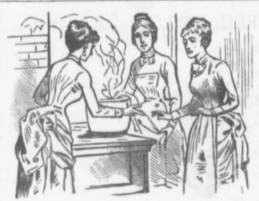
"Well, then; I shall set up a dyeing establishment."

busy, or too lazy to dye for themselves, or too careless to do it successfully."