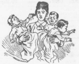
Man that is born of woman is small polatoes and few in a hill.