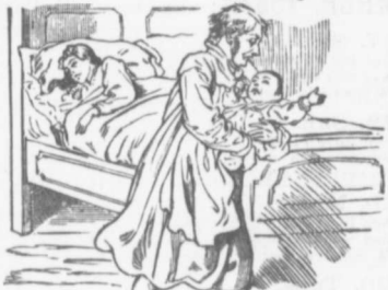
The first-born hath the colic every night, but his better half sleepeth soundly while he walketh the floor.