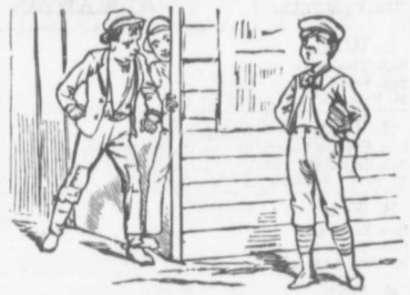
He goeth forth in the morning warbling like a lark, and is knocked out in one round and two seconds.