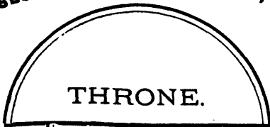
DIAGRAM OF THE SENATE CHAMBER. 1ST SESSION, 8TH PARLIAMENT, 1896.