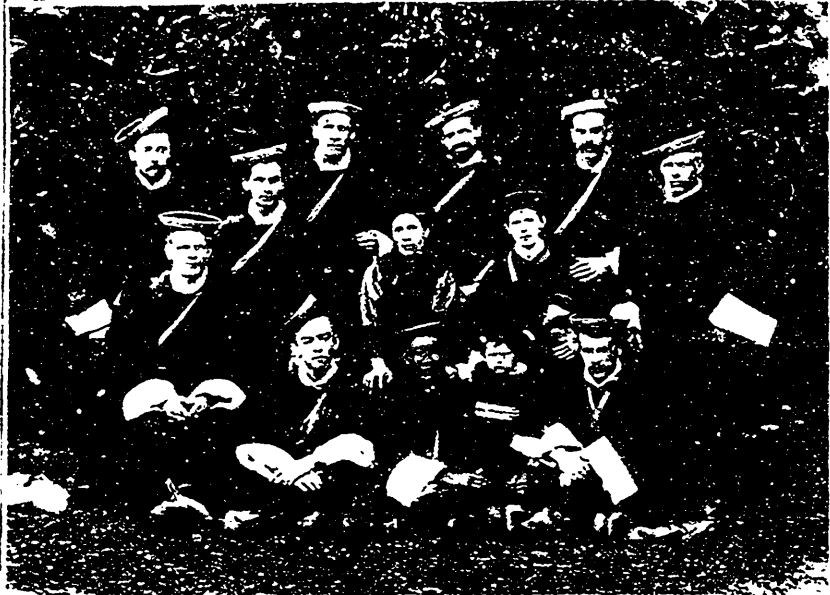
THE ORIGINAL PIONEER TIBETAN MISSION.