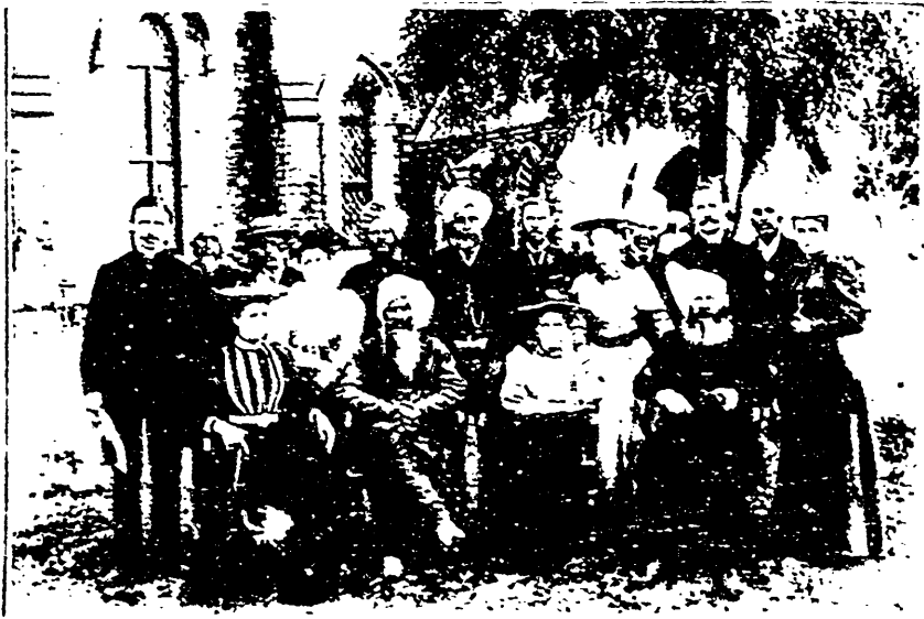
A GROUP OF PUNJAB MISSIONARIES AND NATIVE PASTORS.