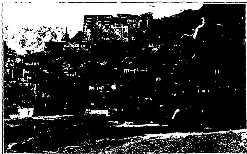
Palace of the former kings. A VIEW OF THE TOWN OF LEH, LADAK.