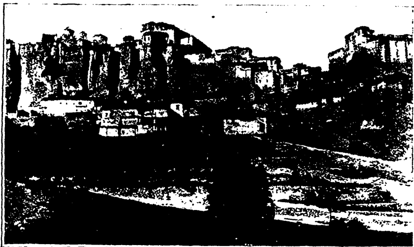
LAMAQUADA MONASTERY, LADAK. TIBET.