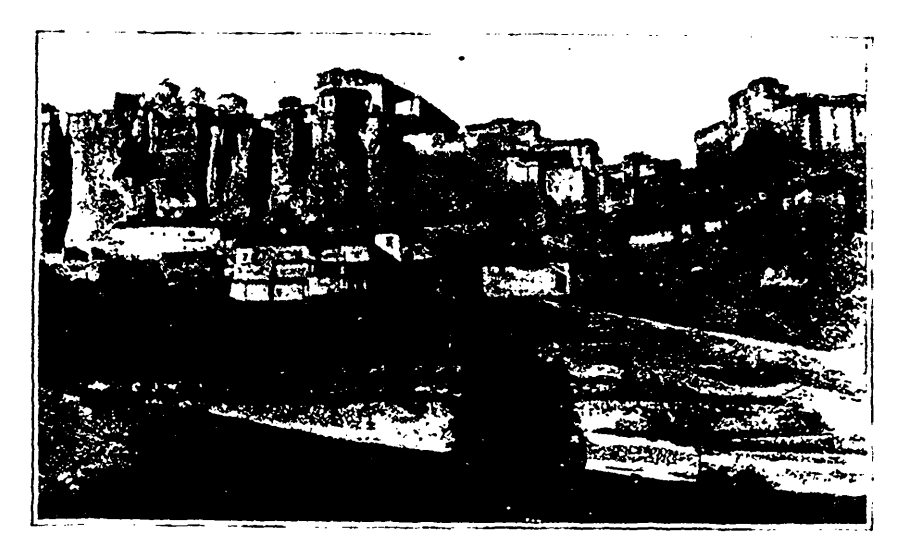
LAMAQUADA MONASTERY, LADAK, TIBET.