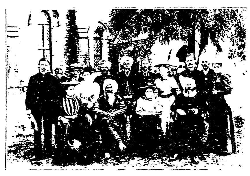
A GROUP OF PUNJAR MISSIONARIES AND NATIVE PASTORS.