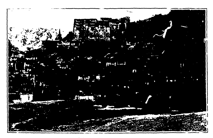
\begin{array}{c} {\rm Palace\ of\ the\ former\ kings.} \\ {\rm A\ \ VIEW\ \ OF\ \ THE\ \ TOWN\ \ OF\ \ LEH,\ \ LADAK.} \end{array}